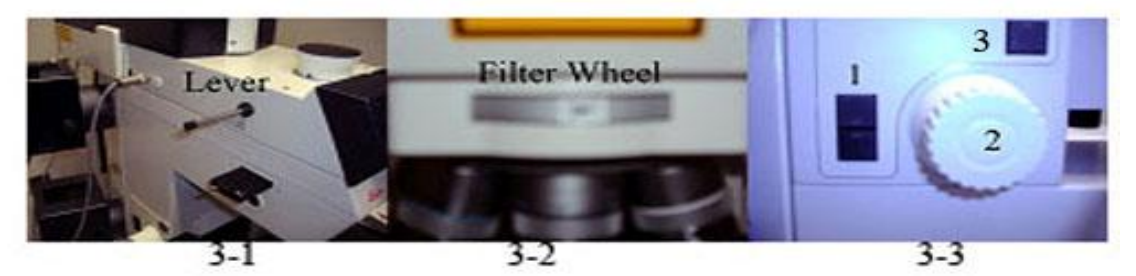
Fig 3-1: Switch the microscope to confocal mode by fully pulling out the lever

Fig 3-2: Adjust the filter wheel to position 4, which is for confocal imaging