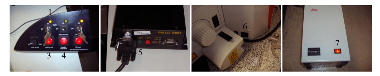
Figure 5 Shutdown

down the following four units in order as shown in Figure 5: